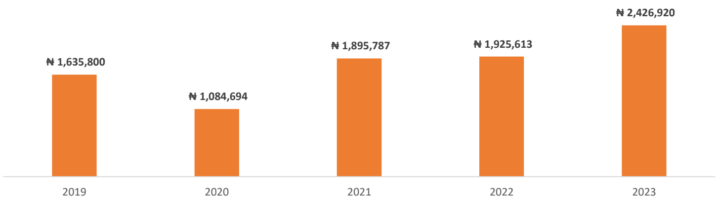
Annual Total Internally Generated Revenue (N'mn)